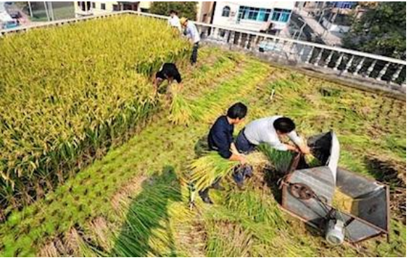
Figure 2: The rising of rice on a roof in Shaoxing [2]