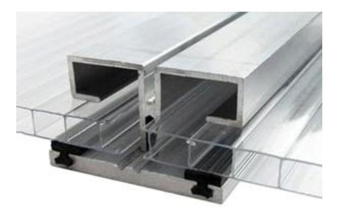
Figure 5: The sealed aluminum profile used for the roof construction []

The large farms in urban and peri-urban roof is a commercially viable way to feed cities, and offer fresh local produce artisan responsible for the urban population.