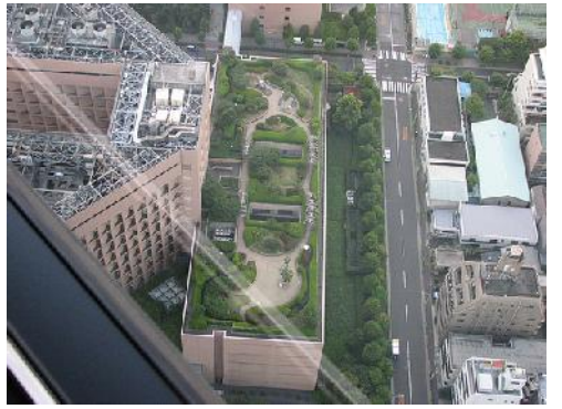
Figure 1: The roof of a hospital from Tokyo [1]

Figure 1 shows an example of fitting small plant growing on the roof of St. Luke's International Hospital in Akashi, Tokyo, and in Figure 2 is shown a roof of 120 m^2 from Shaoxing in east China's Zhejiang province where rice was successfully cultivated [1], [2].