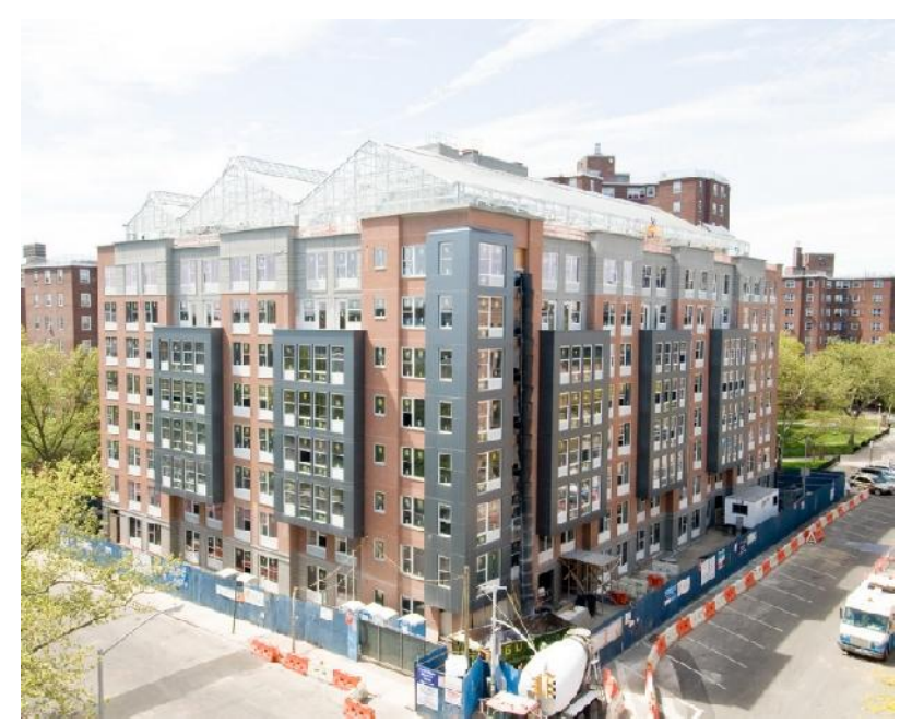
Figure 4: Greenhouse developed by the Nexus Corporation company in New York, US []

A world-renowned company, among others, for the construction of greenhouses located on the roof is Nexus Corporation in the United States [5]. A project completed by the company at Arbor House, New York is shown in Figure 4.