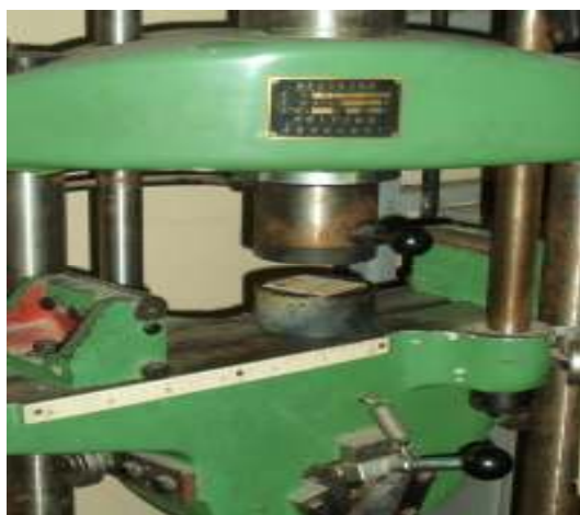
Figure1. Universal testing machine WE-10A, equipped with two flat plates to compress veneers