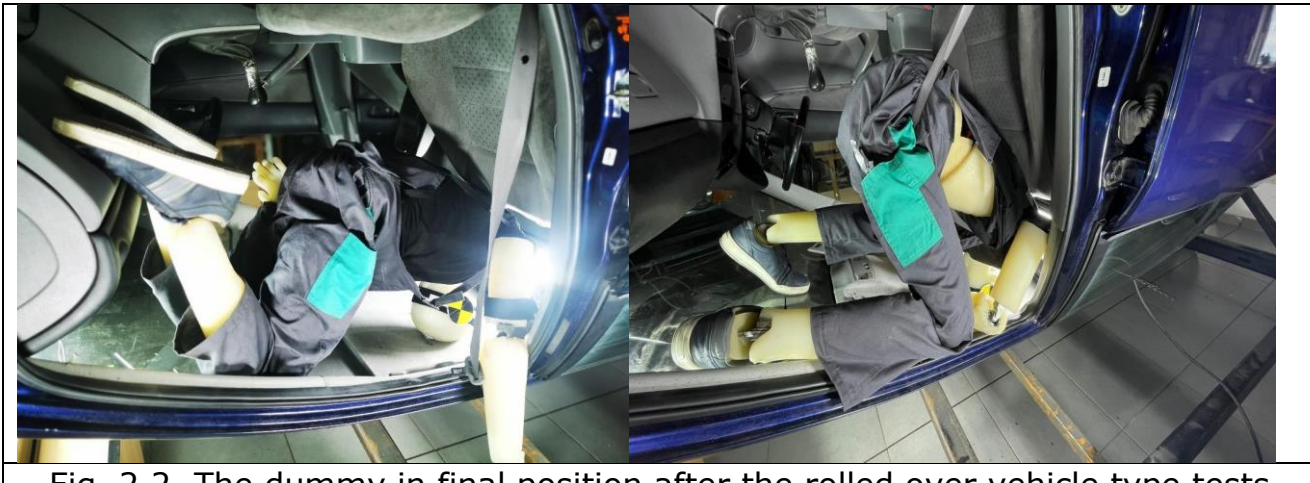
Fig. 2.2. The dummy in final position after the rolled over vehicle type tests

Using the PIC DAQ tool we managed to compare data from the experiments: