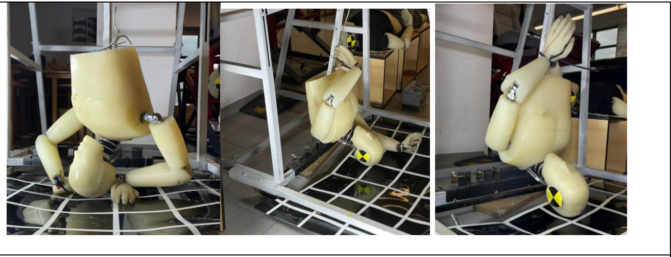
Fig. 2.1. The dummy position after the pendulum type tests

The second experiment stays in collecting data about injuries when the dummy is placed in a car, which is really on its top, and it is using the required method for escaping from a car, which means supporting itself with its legs on the windshield of the car while releasing the seatbelt.