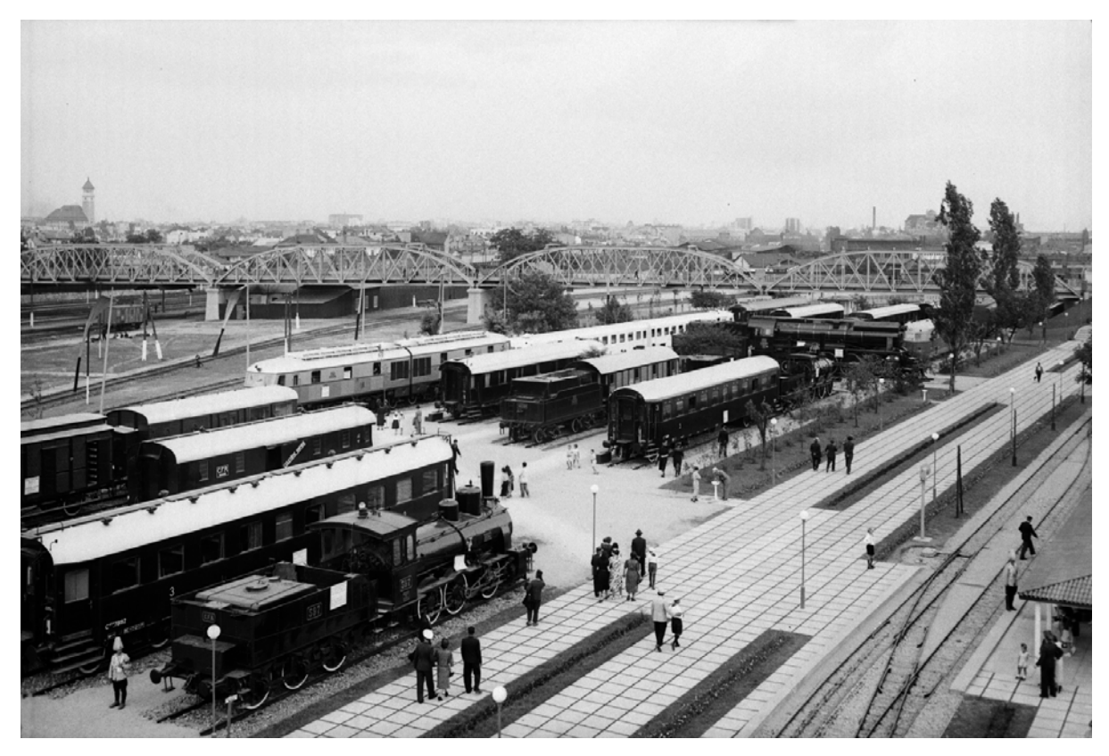
Fig. 1 The first place of Romanian Railways Museum, near Giulesti stadium

Later, Theodor Bals came in as general vice manager of CFR and he started this by this position the rescue action to dispose of several representative types of locomotives Romanian railway transport. These can include the locomotive number 43 Calugareni (one of the first circulated, in 1869, on the Bucharest – Giurgiu railway track.) and Romania locomotive number 103 (the first batch of locomotives made by the company Strussberg). But the efforts of Theodor Bals might not have had the same odds and work without enthusiasm "anonymous", railroad workers with a big heart, love of trains and proud by institution for that worked. They have taken the initiative to preserve, in addition to locomotives, and various pieces of technical and constructive interest and documentary value and historical documents.