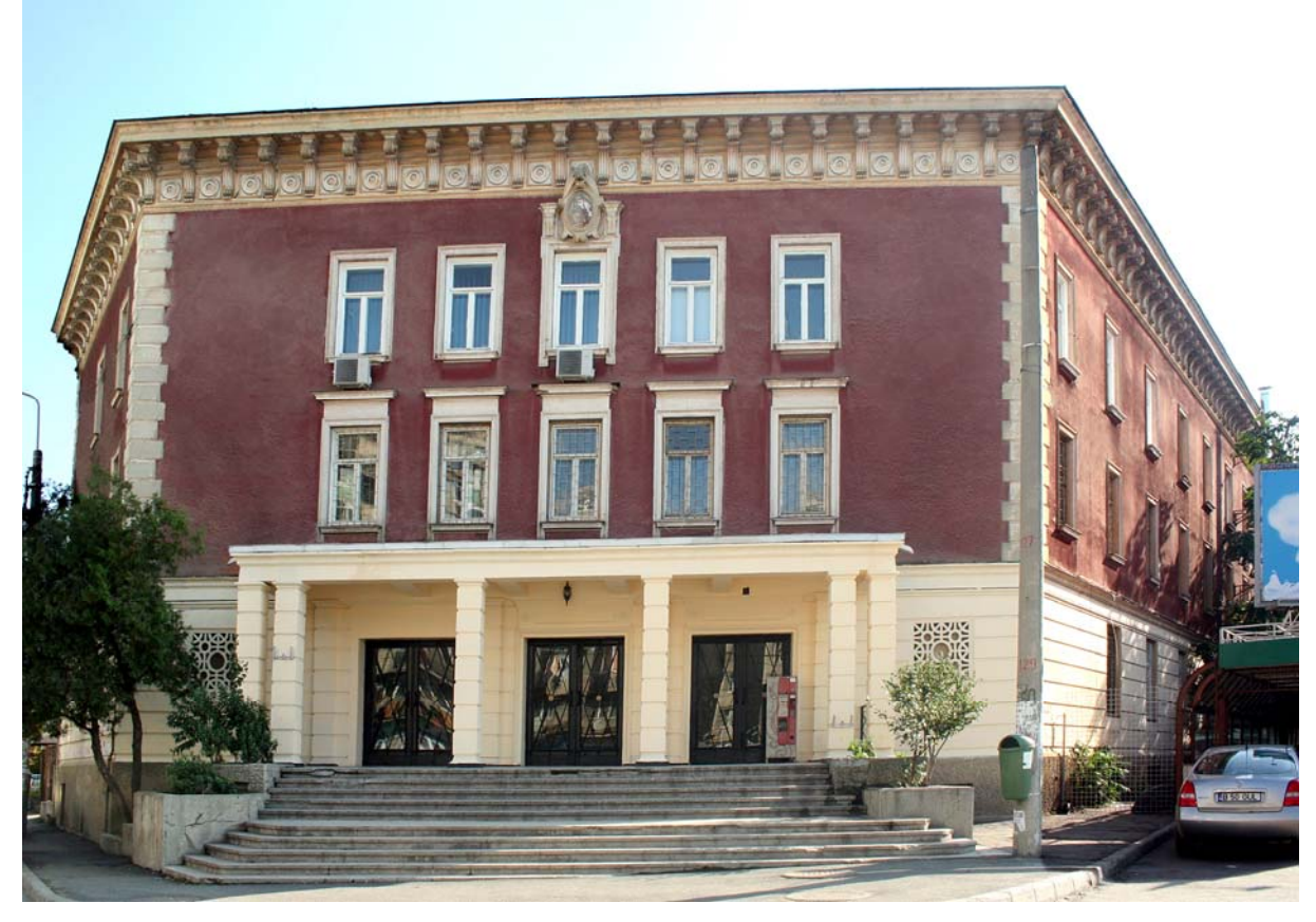
Fig. 3 The present place of Romanian Railways Museum, on Calea Grivitei no. 193B

In 1970, the museum has a space for exhibition, consisting of a wing built on stilts above the 14 line from North Railway Station. Locomotive Călugăreni with three cars rebuilt to IMMR Pascani, a coupon is displayed on the rail, in this building. Access to the museum could be done in two parts, both Grivita old entrance, and directly from North Railway Station.