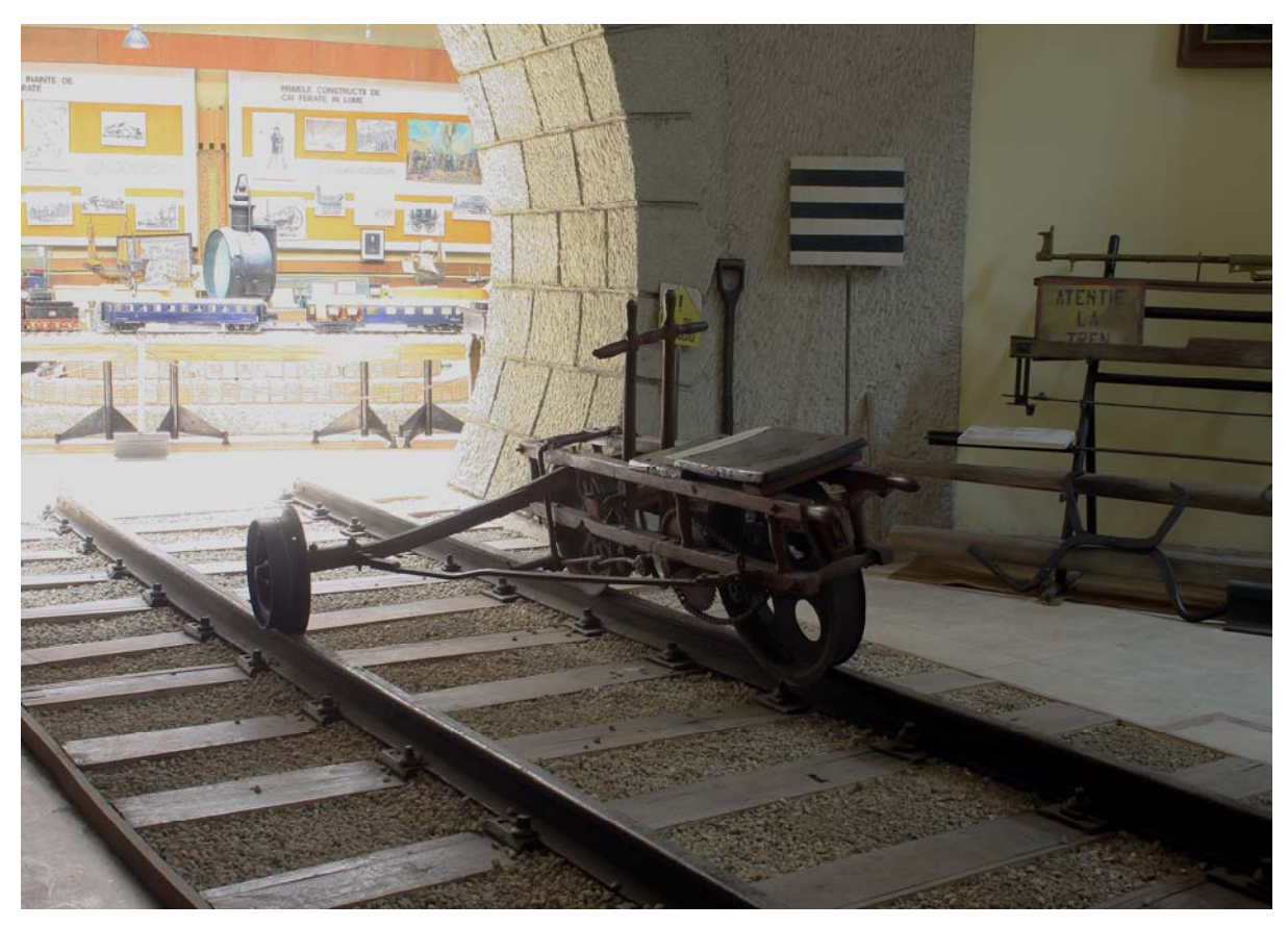
Fig. 4 Inside of the present place of Romanian Railways Museum, on Calea Grivitei no. 193B

In addition to the redevelopment project of the former railway station Filaret, railway museum by CENAFER, made a series of steps to obtain new exhibition spaces being fitted real locomotive.