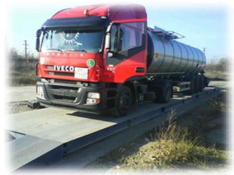
Fig.11 Volumetric measurement of milk [8]