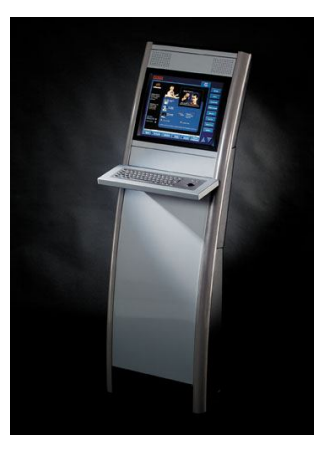
Fig. 8. Interior panel