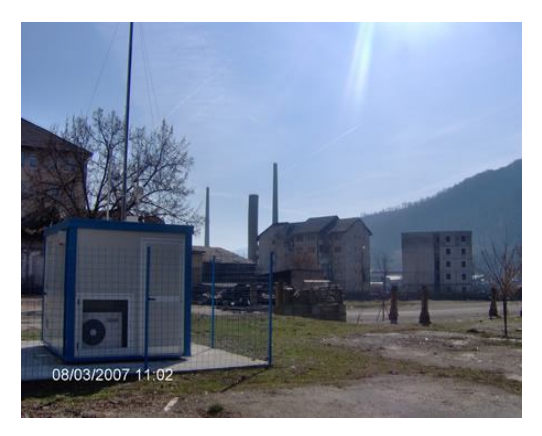
Fig. 2. Industrial type of monitoring station