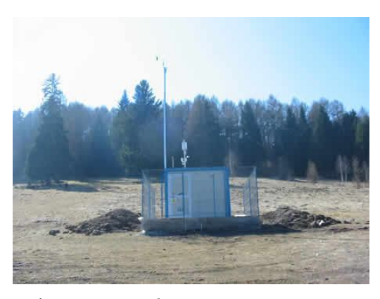
Fig. 5. Regional monitoring station type

- Monitored pollutants are sulphur dioxide (SO2), nitrogen oxides (NOx), carbon monoxide (CO), ozone (O3), volatile organic compounds (VOCs) and particulate matter (PM10 and PM2, 5) and meteorological parameters (wind direction and speed, pressure, temperature, radiant sun, relative humidity, precipitation)