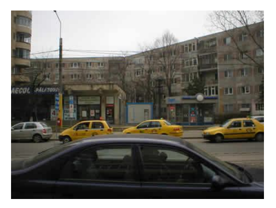
Fig. 1. Traffic type of monitoring station

- Radius area of representativeness is 100m - 1km;