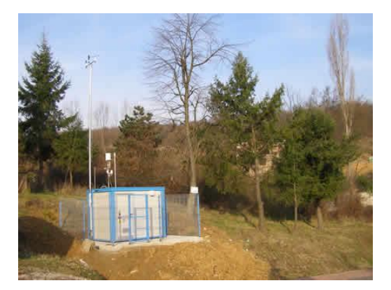
Fig. 6. EMEP type monitoring station