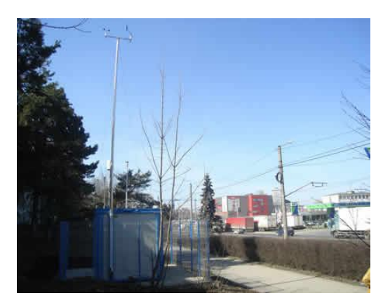
Fig. 4. Suburban type monitoring station

- Monitored pollutants are sulphur dioxide (SO2), nitrogen oxides (NOx), carbon monoxide (CO), ozone (O3), volatile organic compounds (VOCs) and particulate matter (PM10 and PM2, 5) and meteorological parameters (wind direction and speed, pressure, temperature, radiant sun, relative humidity, precipitation).