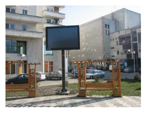
Fig. 7. Exterior panel

Data on air quality from the stations will be presented to the public by means of exterior panels (located in the conventional way in densely populated cities) and with the help of interior panels (located at City Hall).