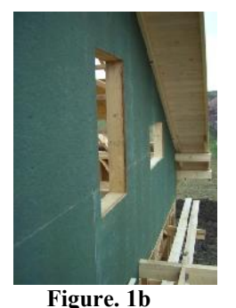
Figure. 1a, b - Building made with exterior wood fiber boards on wood structure