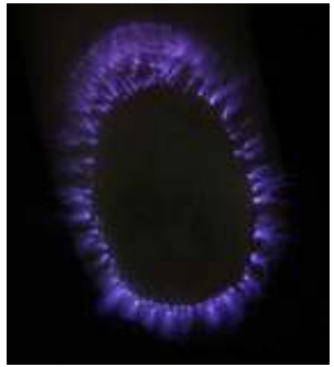
d: right hand's forefinger