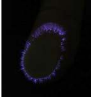
e: right hand's thumb